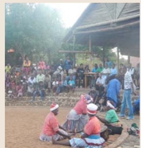
The Makuleke community performing a role play about their rich history