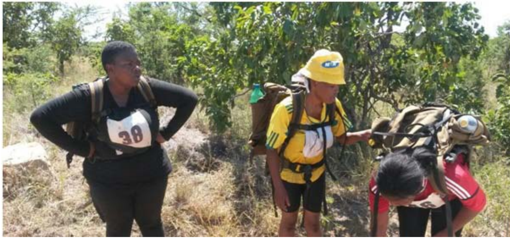
Potential female recruits doing a 10 km walk with backpacks as part of the selection process.

An exciting aspect of the project is that the SAWC will collaborate with employers as partners in delivering a high quality workplace learning experience, which should see these youth integrated into the workplace a lot more easily. In addition, the project has set a gender target of at least