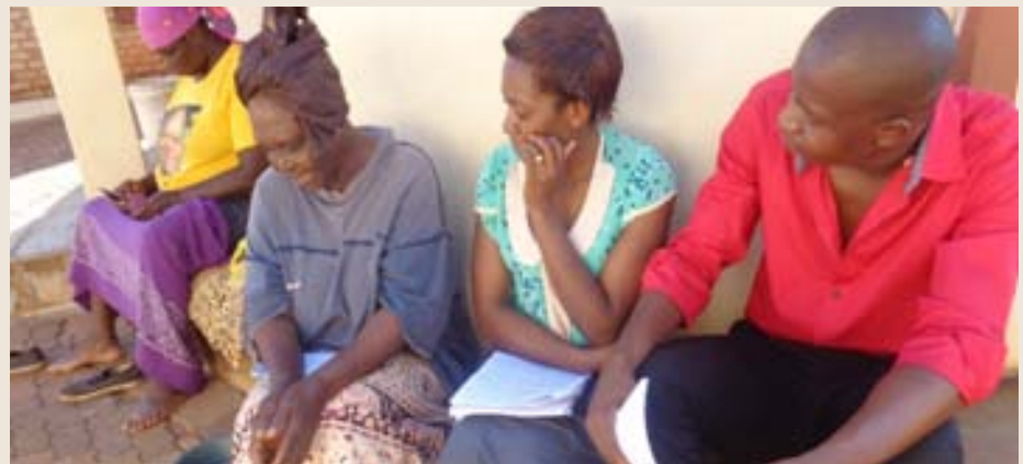
Students interviewing Makuleke village member for dashboard: Photo taken by SAWC Students

The photo below shows the "role play" by the Makuleke. The role play took place at Makuleke Cultural Centre and Bed and Breakfast and demonstrated the forceful removal from their ancestral land to where there are now.